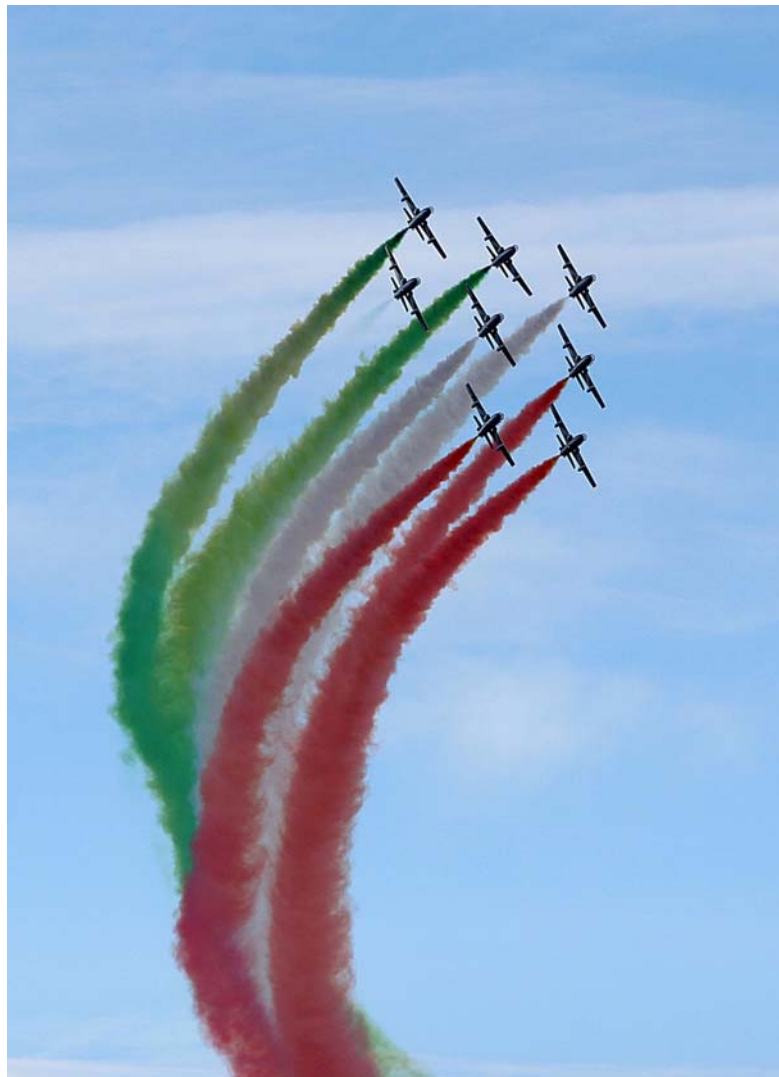
“FRECCIE TRICOLORI” FOR EUROPEAN CUP FINALE-ARTA TERME ZONCOLAN 2006